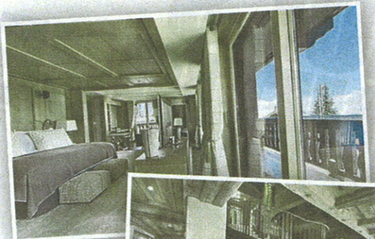
Rich pickings: The sumptuous interior of Chalet Edelweiss has priceless art adorning the walls

Chalet Edelweiss genuinely is the height of luxury. But for the rest of us, a fur coat is better than nothing, particularly when you're up a mountain.